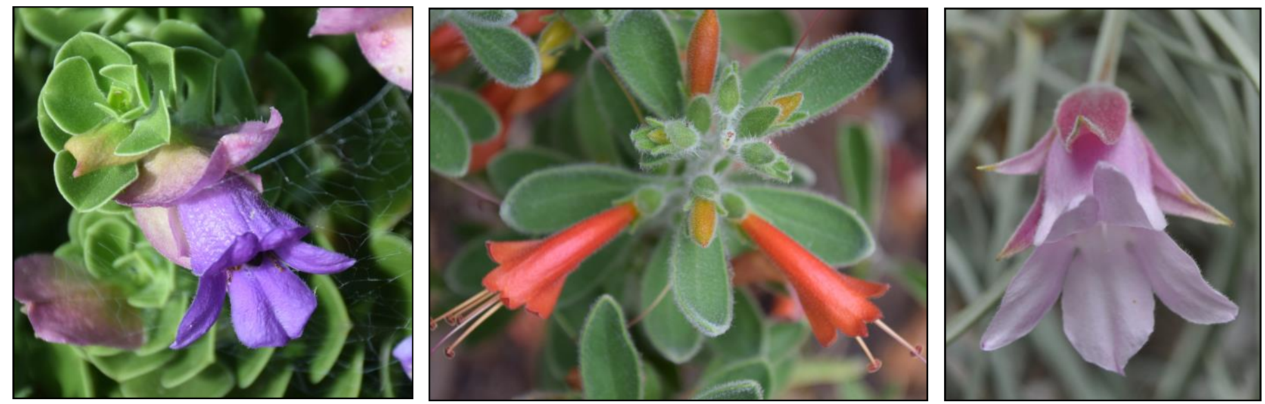
Australian Plants Society - Warrnambool & District Group April 2023 Newsletter 496